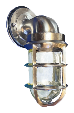
(Satin Nickel, J-Box Adapt)